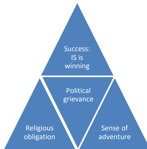
Figure 1: The Islamic State's Narrative

The Islamic State has a multifaceted narrative that appeals to its various target audiences in several ways, as depicted in the pyramid in Figure 1. The three messages at the bottom of the pyramid—religious obligation, political grievance, and sense of adventure—are some of the most difficult for IS's foes to counter. They are also the areas upon which a significant amount of counter-IS messaging has focused.