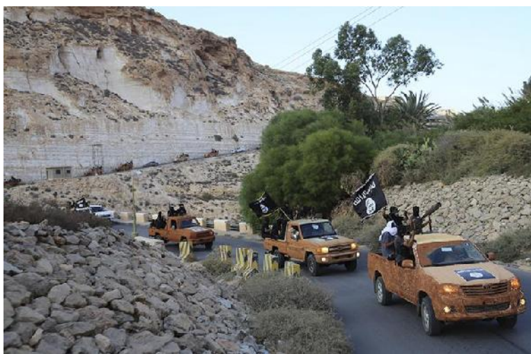
Figure 2: Photo of a convoy of IS militants near Derna

In addition to obscuring its losses, IS has systematically exaggerated its strength. Part of the reason it has done so is precisely to disguise those losses. The best example of IS's tendency to exaggerate and embellish is in Africa. In October 2014, a group of militants in the eastern Libyan city of Derna openly pledged bayat to IS, and declared that they had established an emirate in the city. Soon after the bayat pledge, IS flooded social media with videos and pictures of IS militants in Derna, including a video showing a parade of militants waving IS flags as they drove down a thoroughfare in the city.